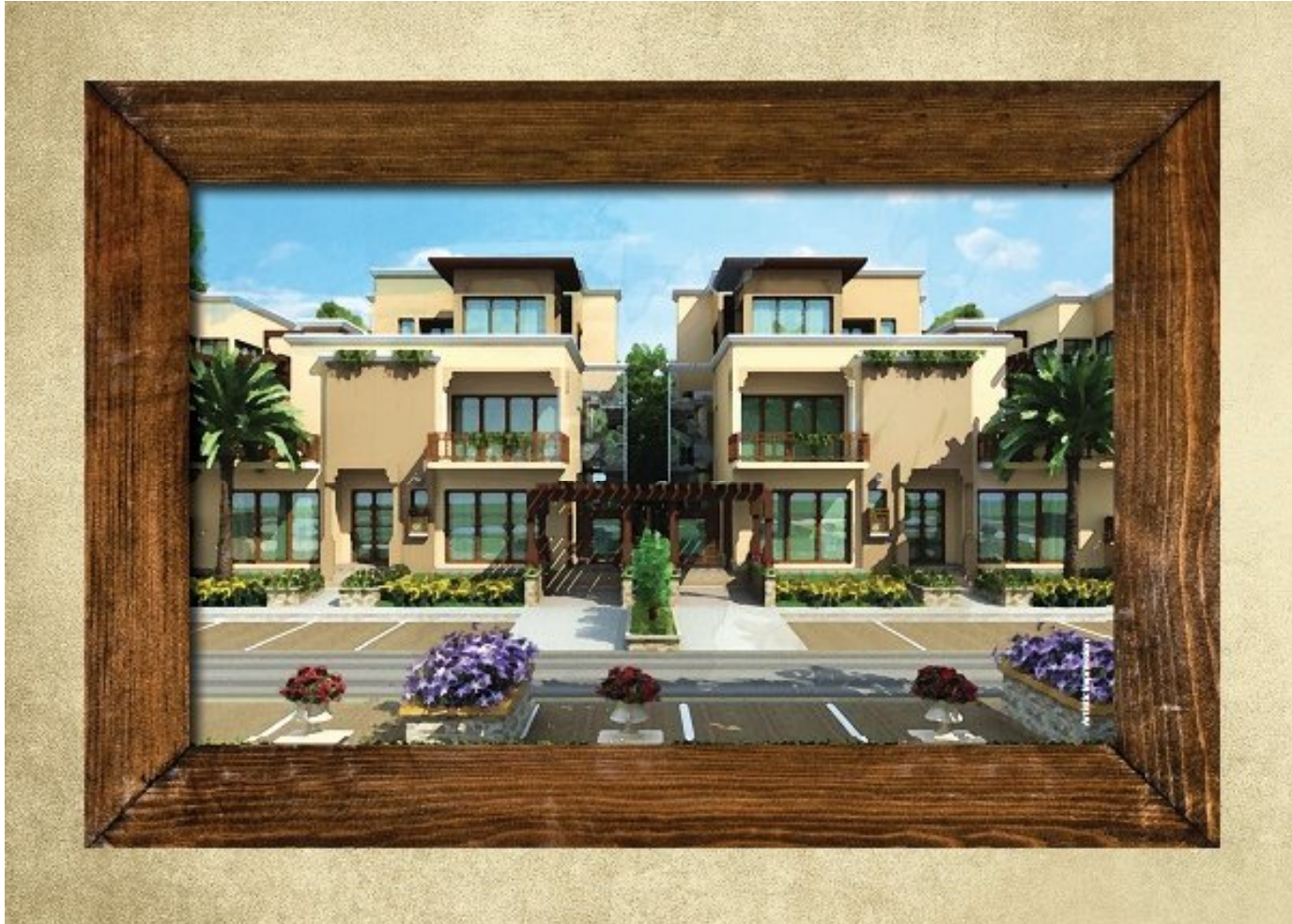
Amstoria Chateau @ Sector -102 ,Gurgaon Size : 569 sqyd.