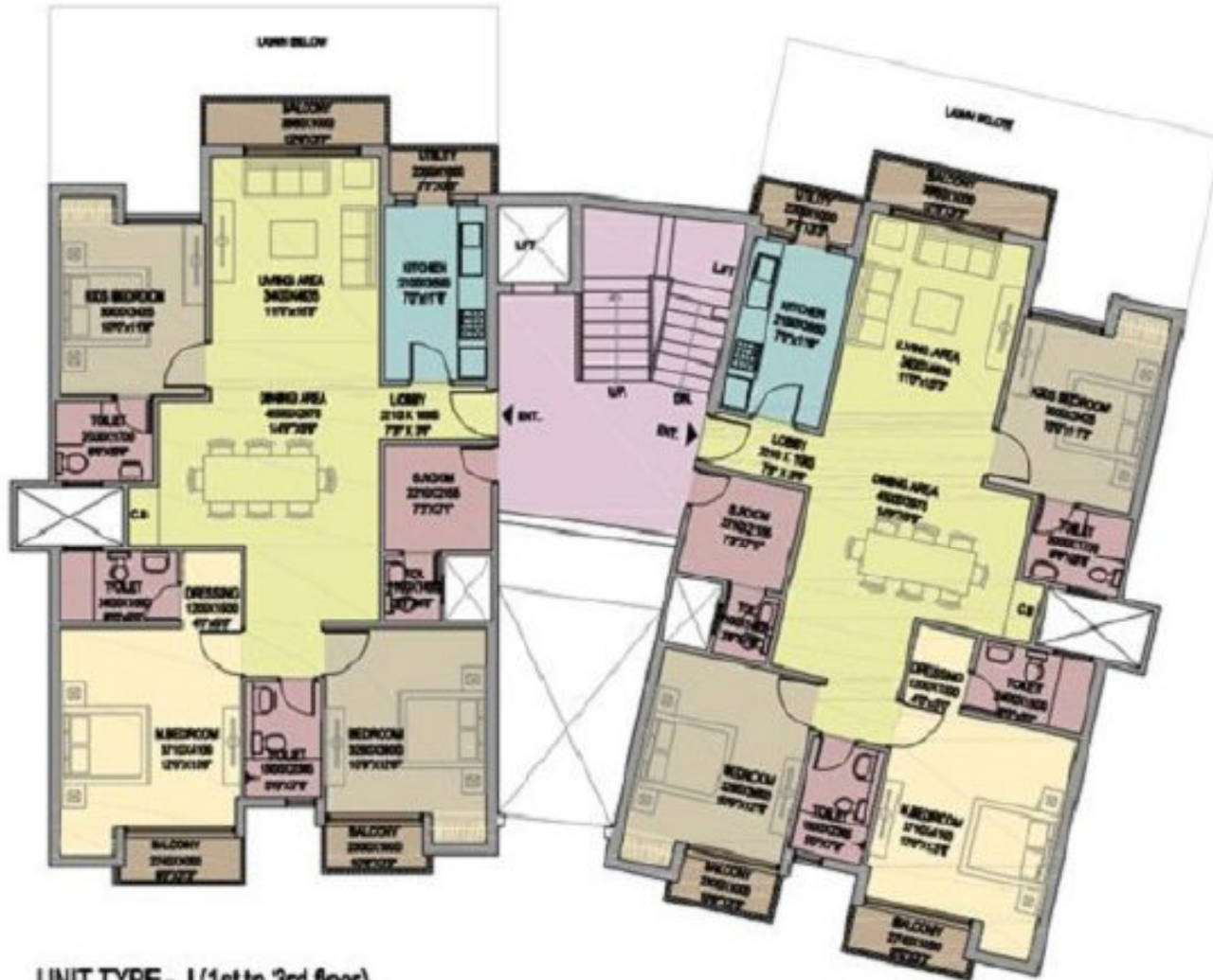
UNIT TYPE - J (1st to 3rd floor) SUPER BUILT UP AREA=1900 Sq.ft.

NOTE : THE LAYOUT PLAN AND THE AREAS ARE TENTATIVE AND SUBJECT TO VARIATIONS AND MODIFICATIONS AT THE SOLE DISCRETION OF THE COMPANY 1 SQ.MT = 10.764 SQ.FT