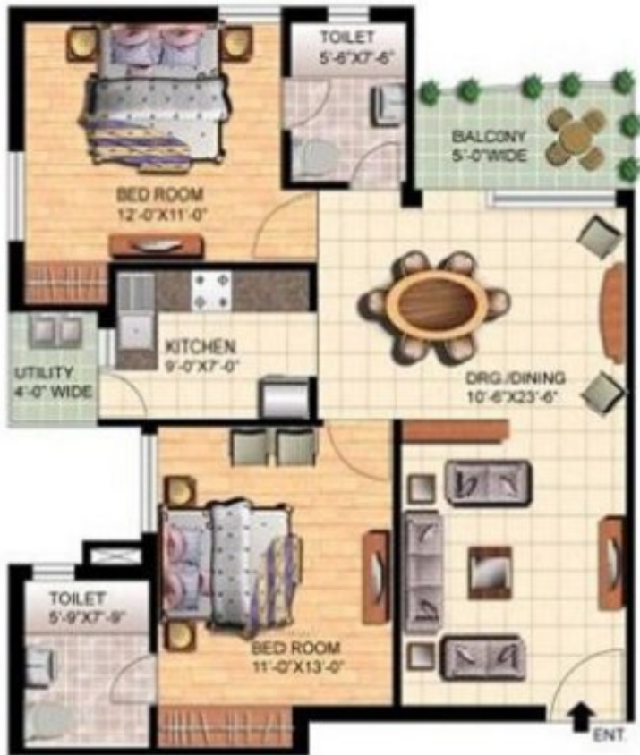
2 BED ROOM SUPEER AREA 1095.0 SQ.FT.