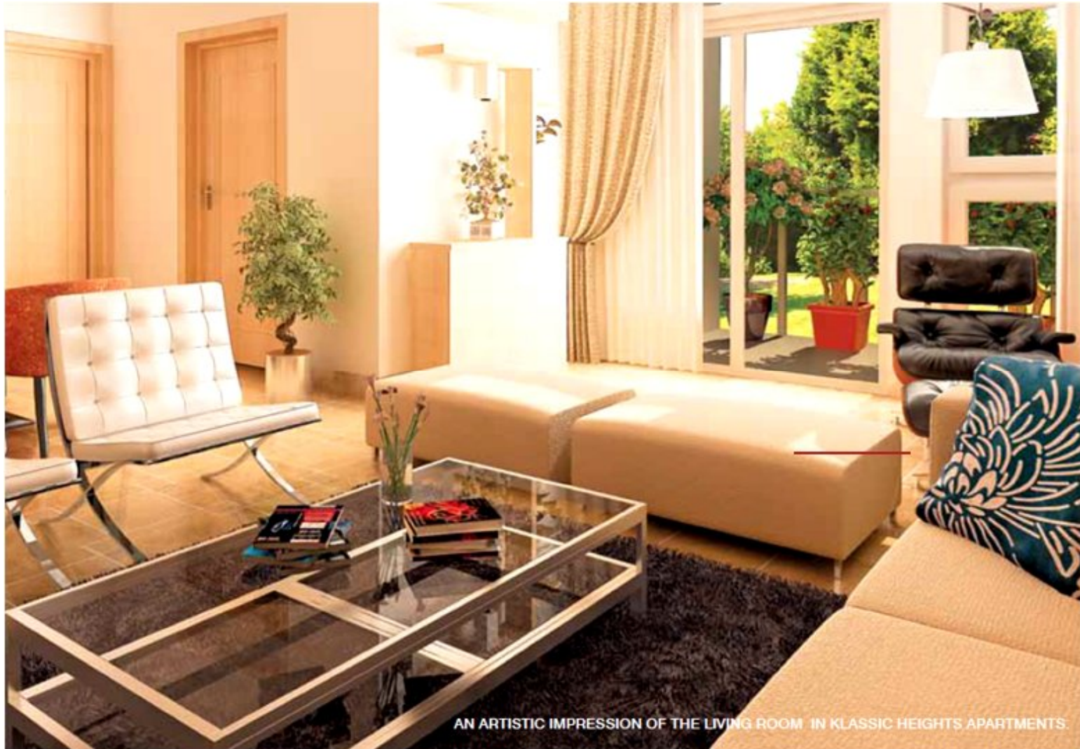
AN ARTISTIC IMPRESSION OF THE LIVING ROOM IN KLASSIC HEIGHTS APARTMENTS.