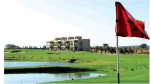
TARUDHAN VALLEY, Gurgaon