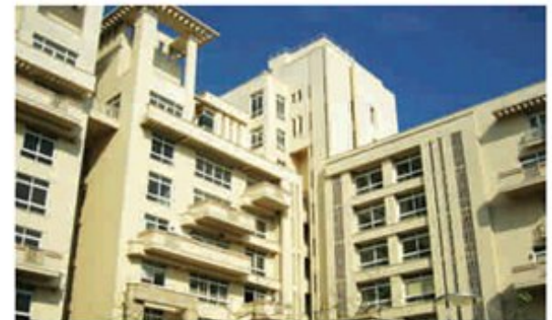
THE IVY, Sushant Lok, Gurgaon