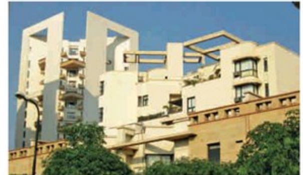
THE LABURNUM, Sushant Lok, Gurgaon