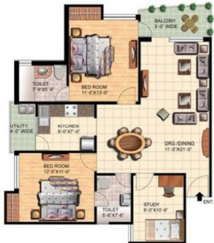
2 BED ROOM+STUDY (SUPEER AREA 1250.0 SQ.FT).