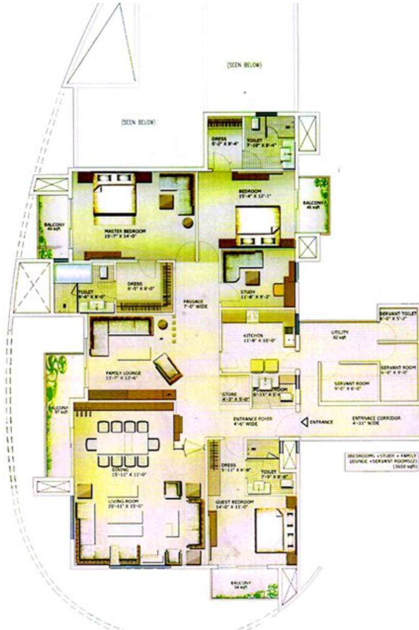
Floor Plan : 3650sqft