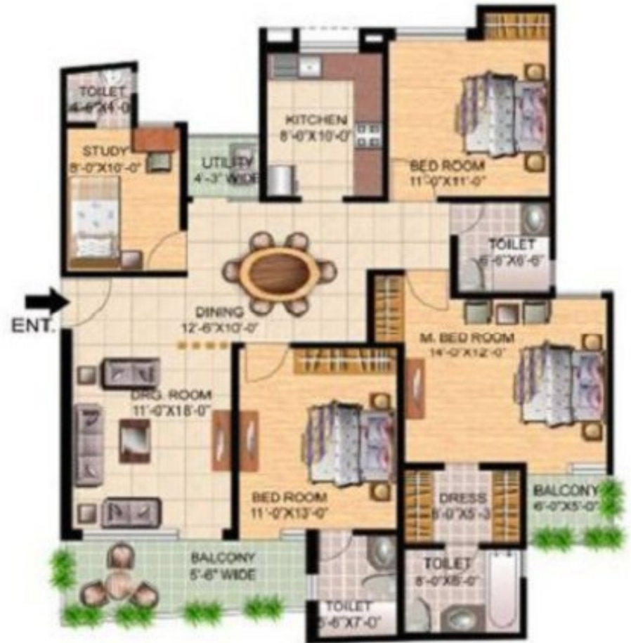
3 BED ROOM+STUDY SUPER AREA 1710.00 SQFT.