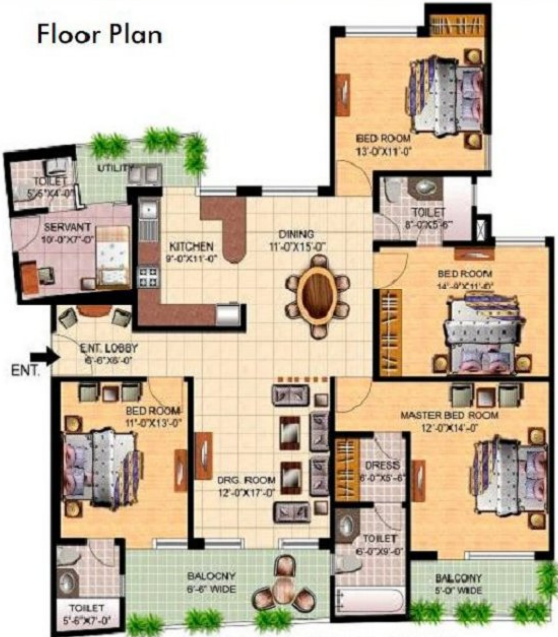
4 BED ROOM WITH SERVANT SUPER AREA 2185.00 SQFT.