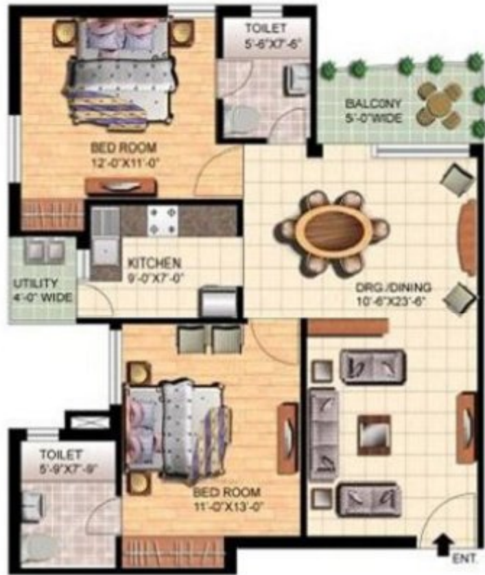
2 BED ROOM SUPEER AREA 1095.0 SQ.FT.