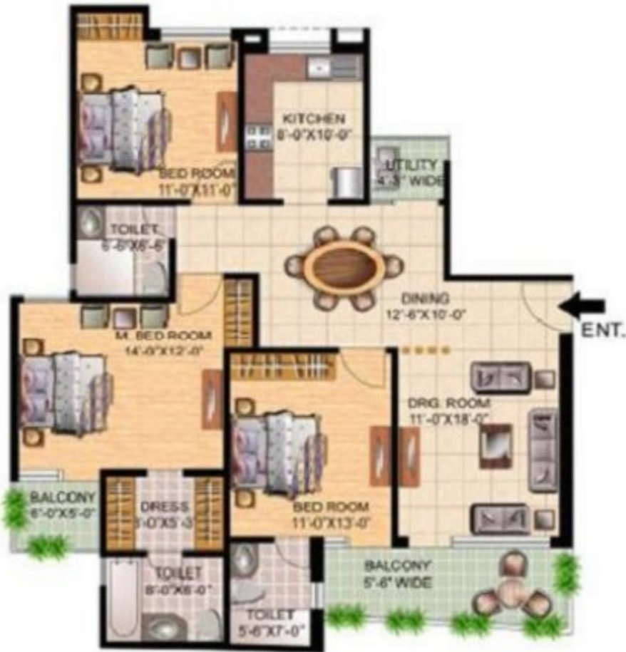
3 BED ROOM SUPER AREA 1575.00 SQFT.