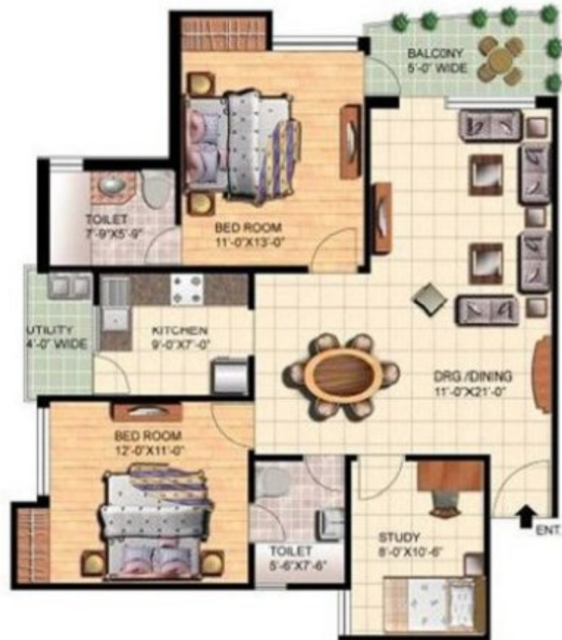
2 BED ROOM+STUDY (SUPEER AREA 1250.0 SQ.FT.)