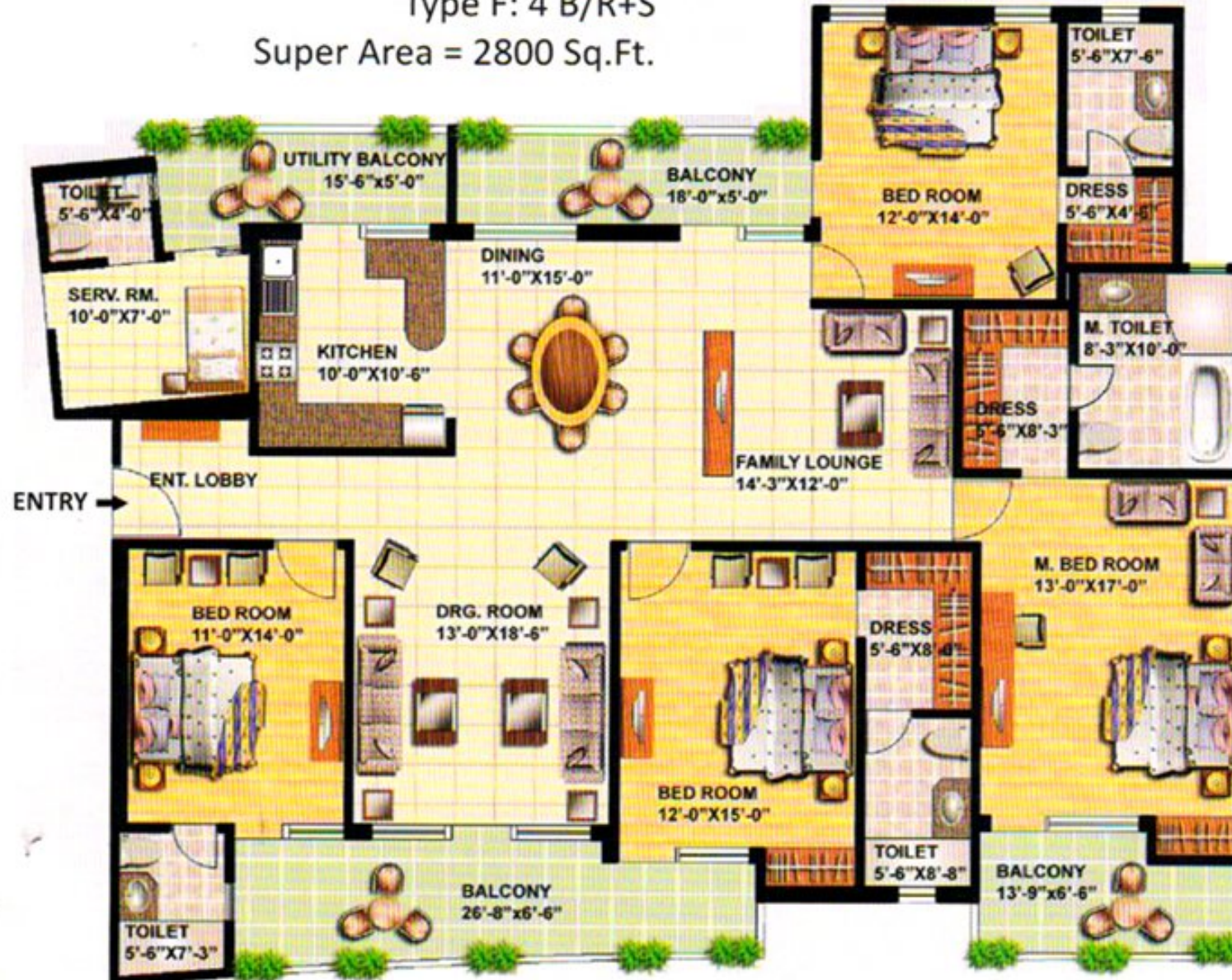
Type F: 4 B/R+S Super Area = 2800 Sq.Ft.