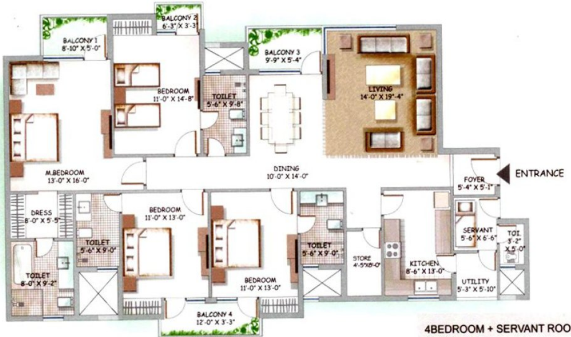
4BEDROOM + SERVANT ROOM (2560 SQ.FT.)