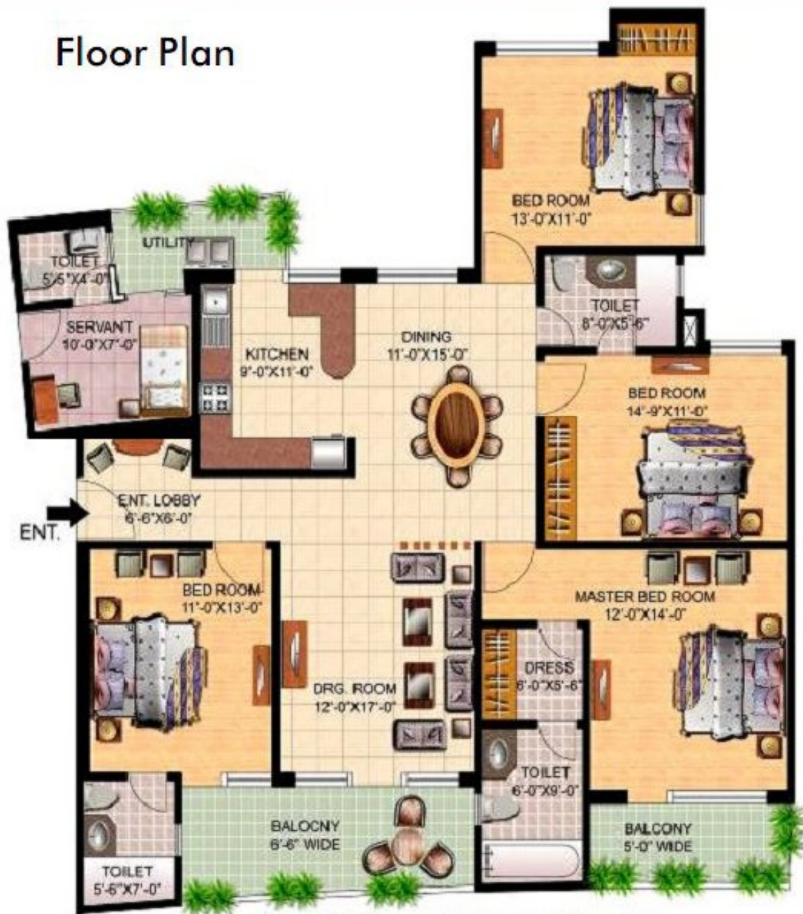
4 BED ROOM WITH SERVANT SUPER AREA 2185.00 SQFT.