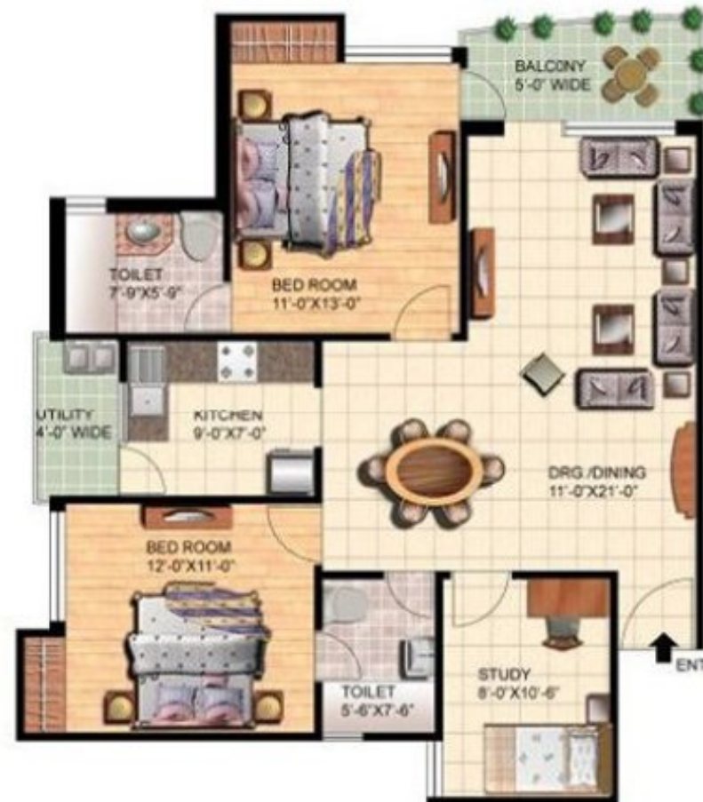
2 BED ROOM+STUDY (SUPEER AREA 1250.0 SQ.FT).