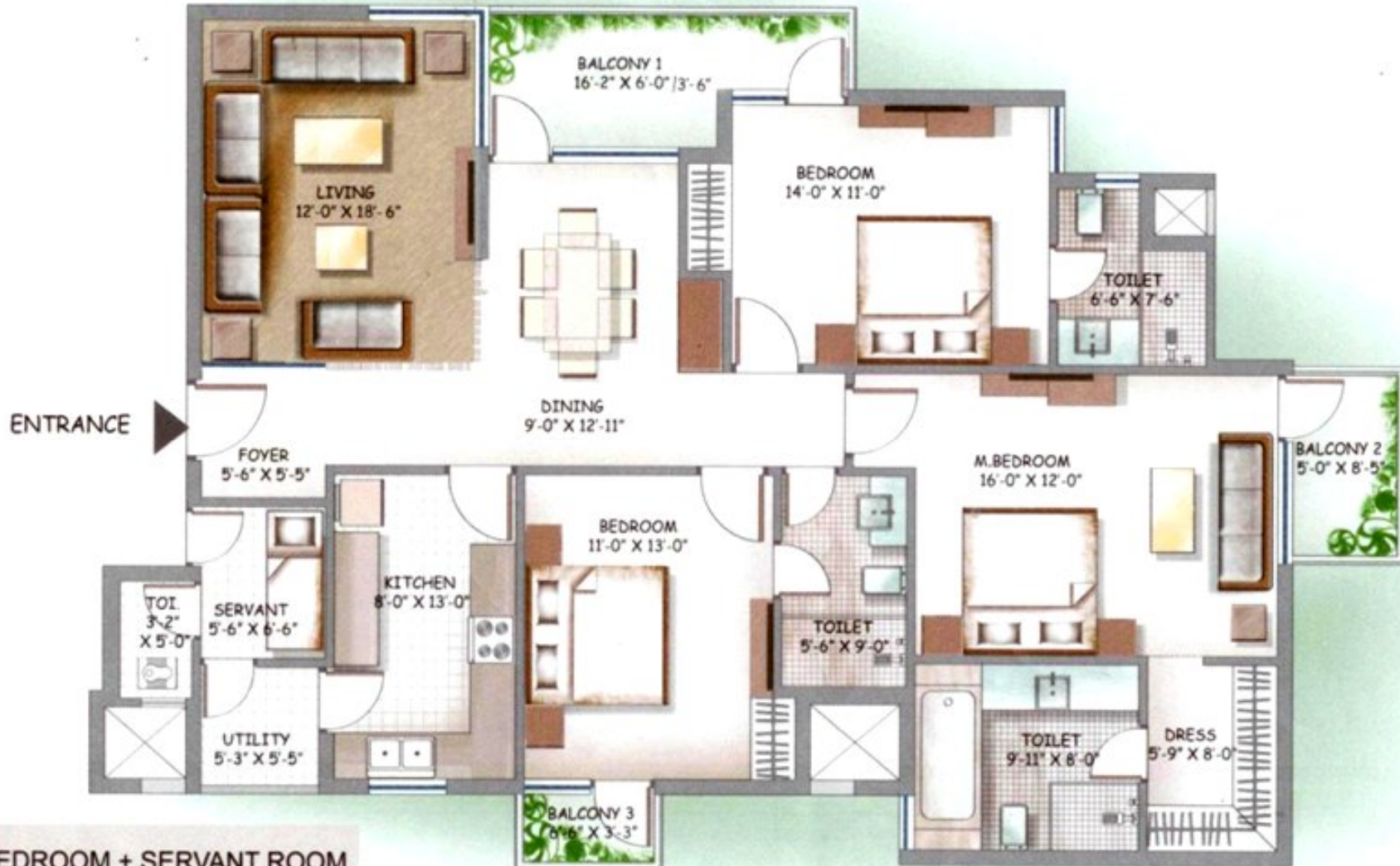
3BEDROOM + SERVANT ROOM (1970 SQ.FT.)