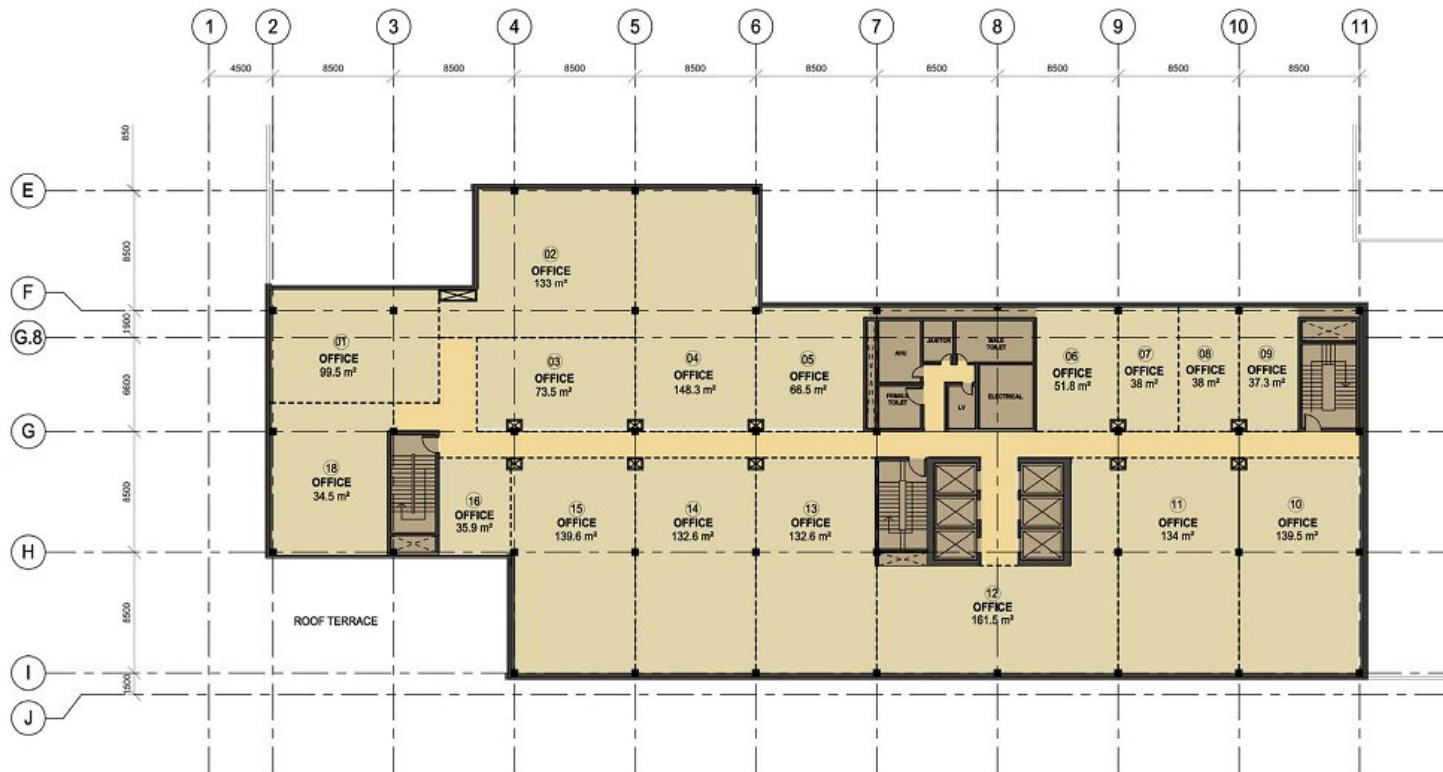
LEVEL 23 GOLD FLOOR PLAN