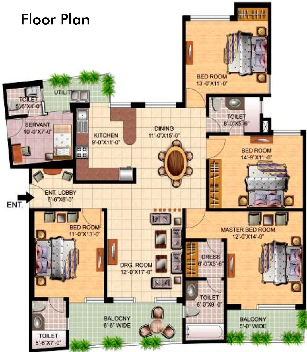
4 BED ROOM WITH SERVANT SUPER AREA 2185.00 SQFT.