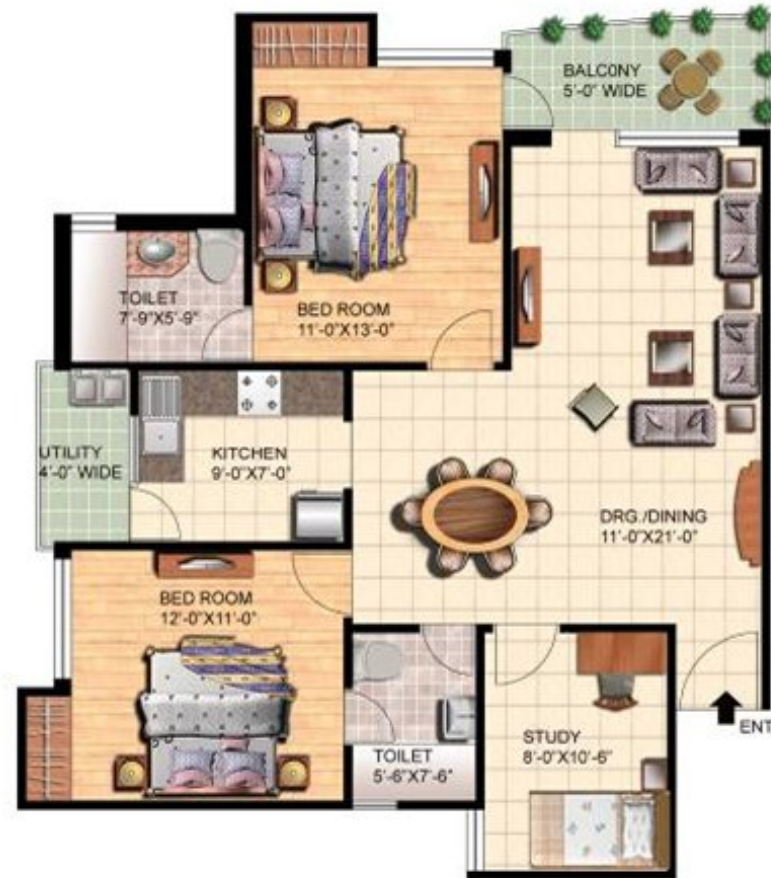
2 BED ROOM+STUDY (SUPEER AREA 1250.0 SQ.FT).