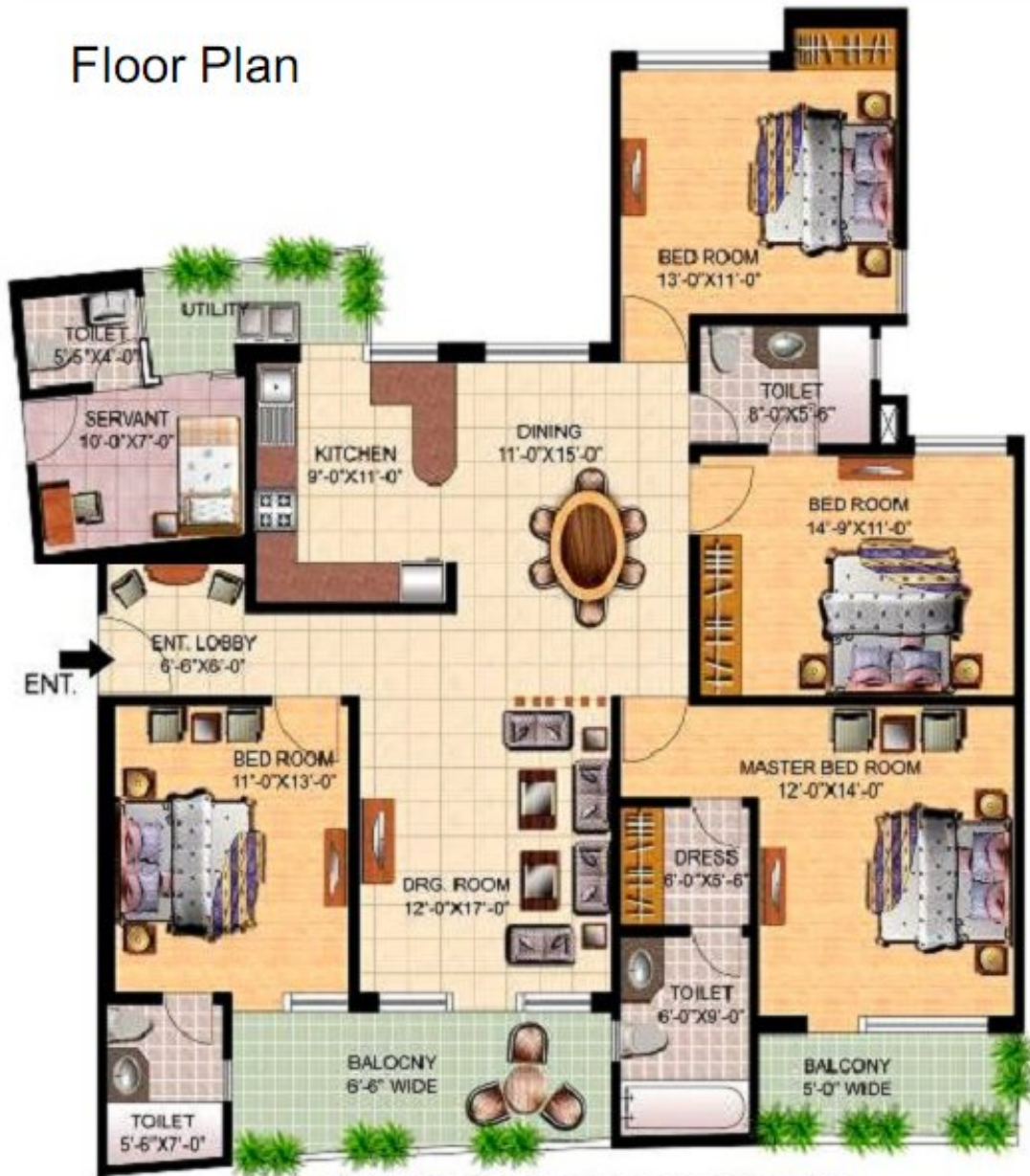
4 BED ROOM WITH SERVANT SUPER AREA 2185.00 SQFT.