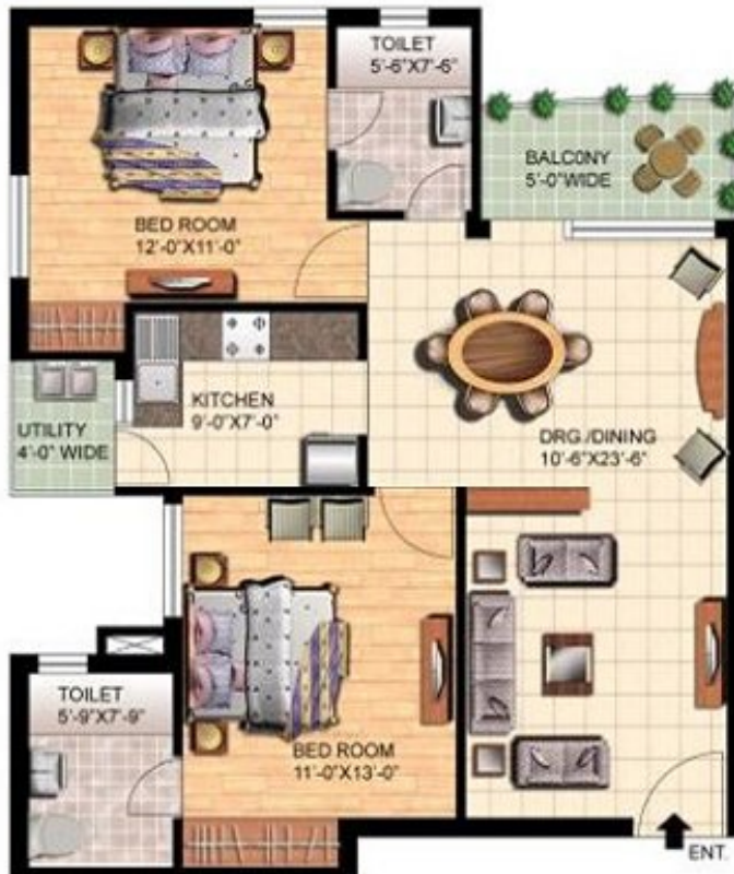
2 BED ROOM SUPEER AREA 1095.0 SQ.FT.