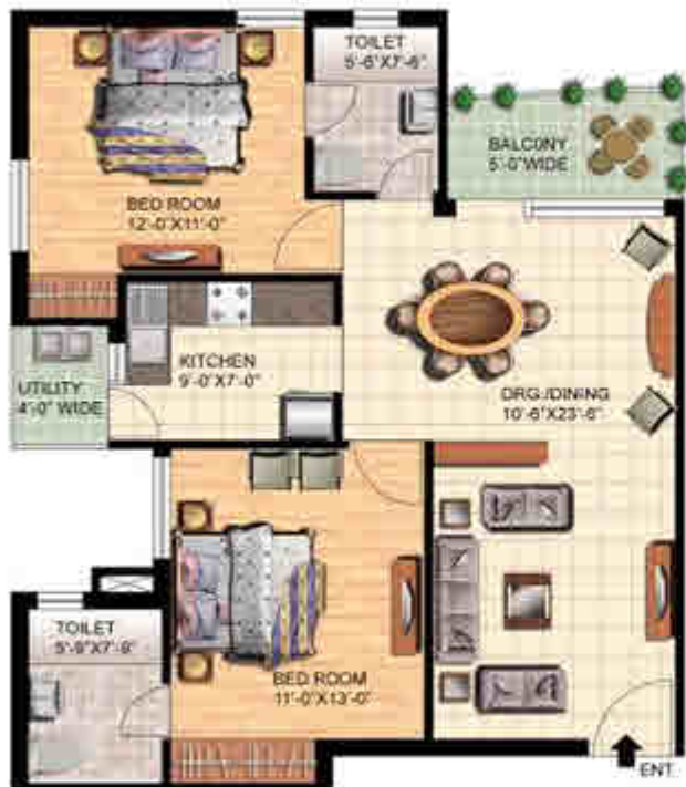
2 BED ROOM SUPEER AREA 1095.0 SQ.FT.