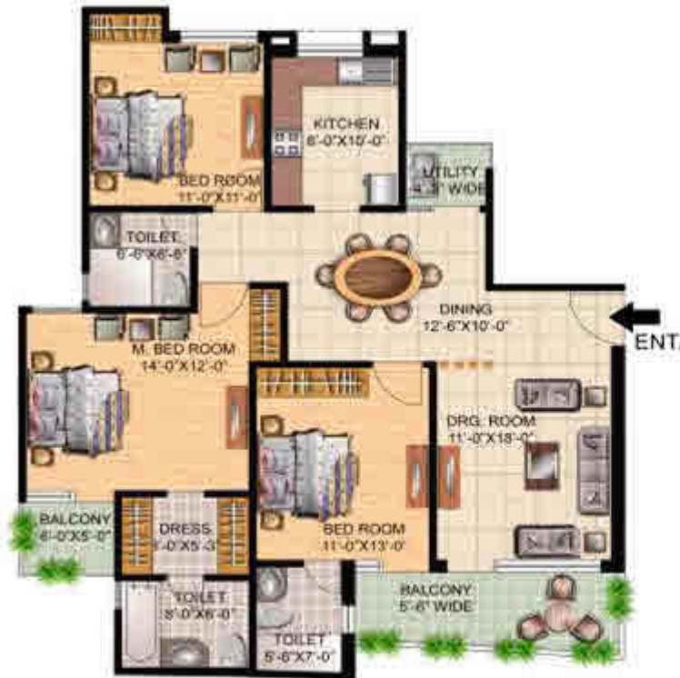
3 BED ROOM SUPER AREA 1575.00 SQFT.