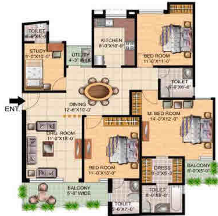
3 BED ROOM+STUDY SUPER AREA 1710.00 SQFT.