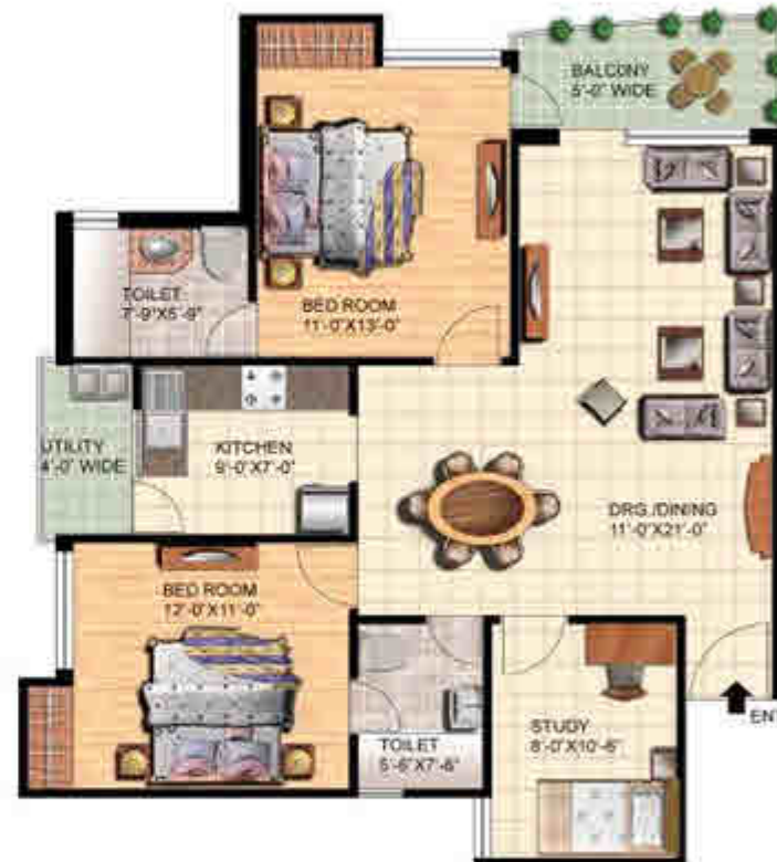
2 BED ROOM+STUDY (SUPEER AREA 1250.0 SQ.FT).