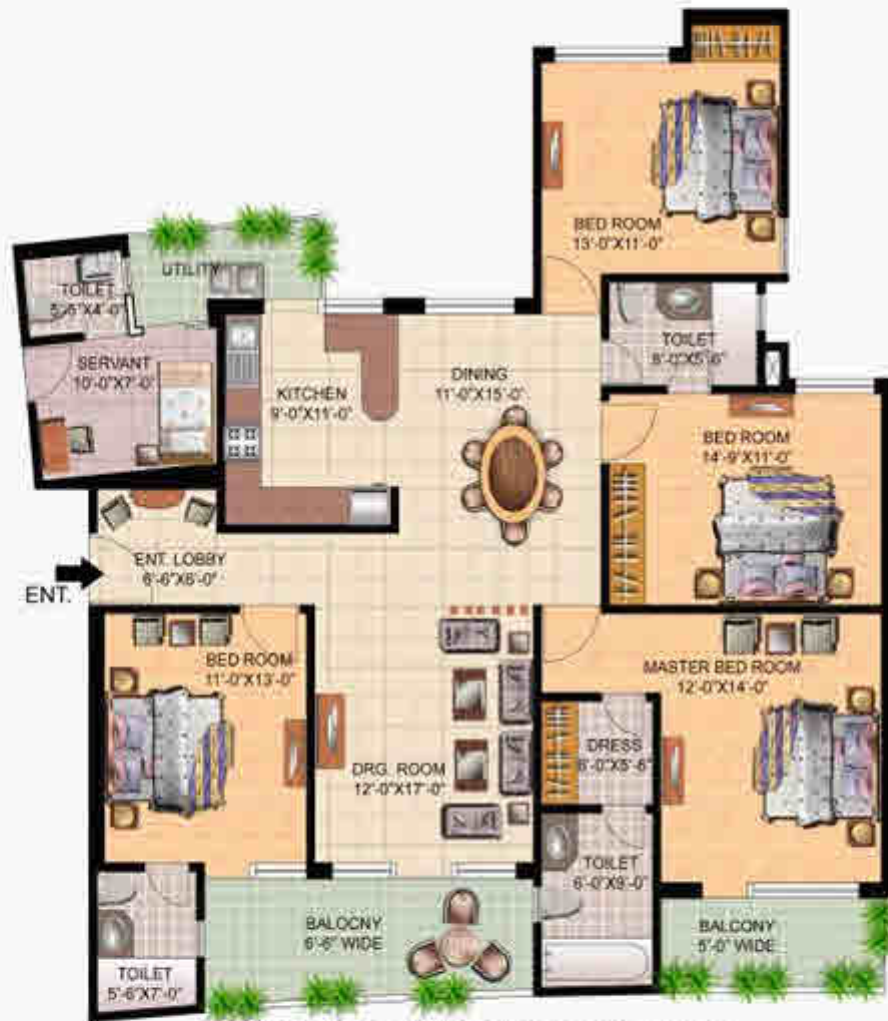
4 BED ROOM WITH SERVANT SUPER AREA 2185.00 SQFT.