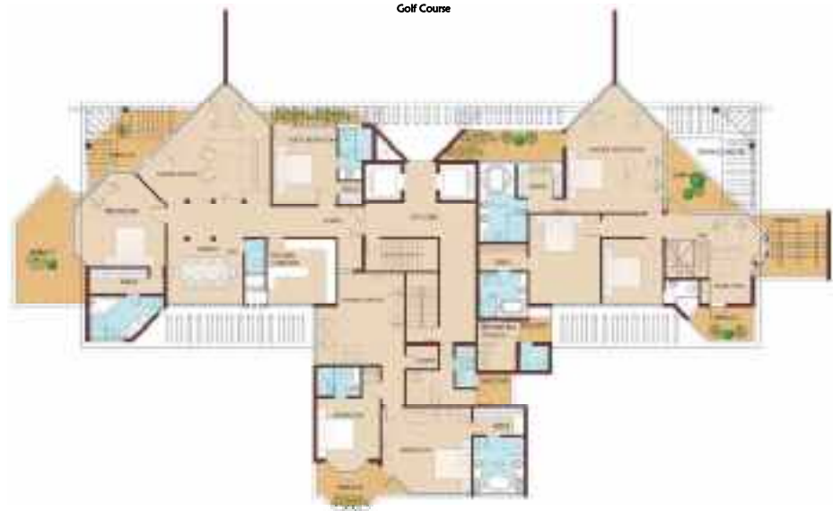
Typical Penthouse Floor Plan