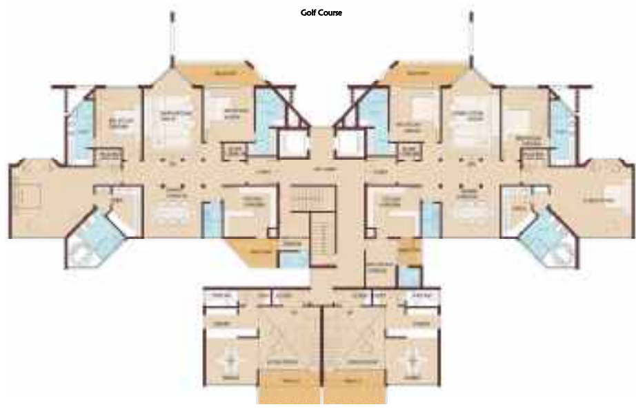
Typical Floor Plan with Loft Level I