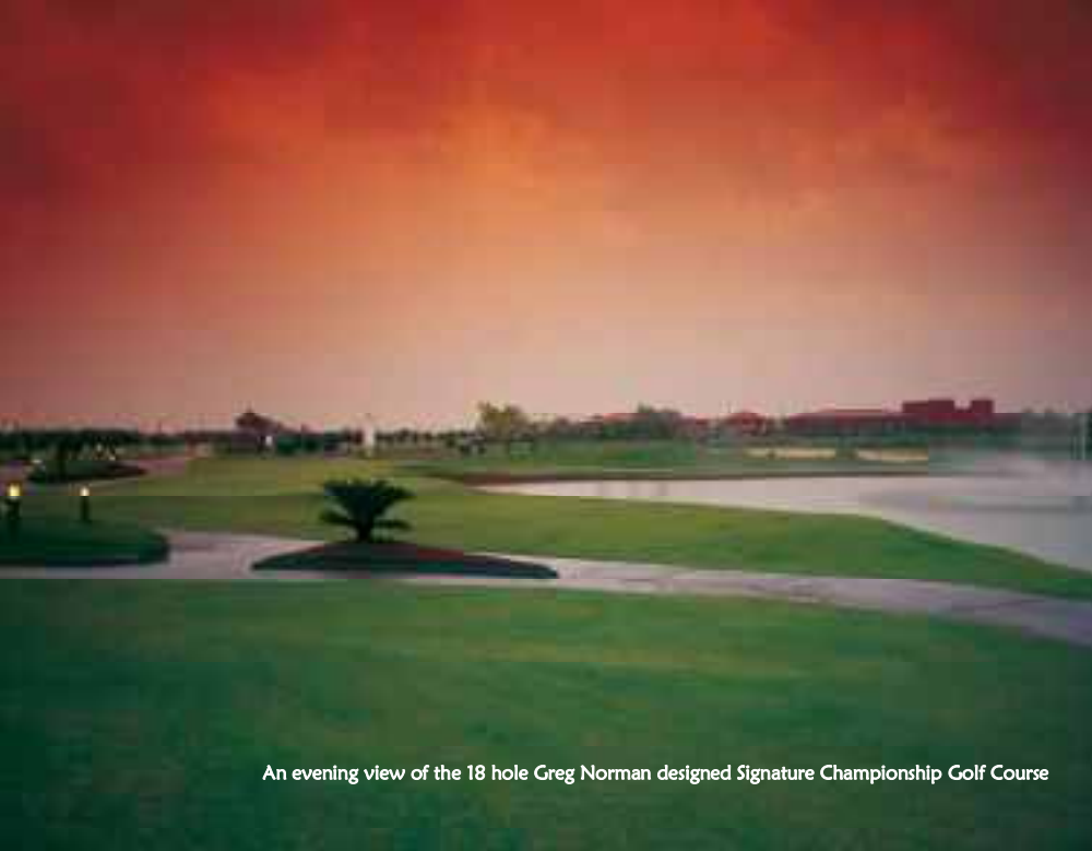
An evening view of the 18 hole Greg Norman designed Signature Championship Golf Course

...a legacy to be enjoyed for generations to come