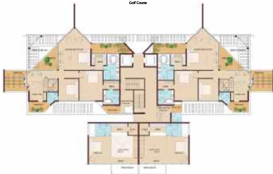
Typical Duplex Penhouse Level II Floor Plan