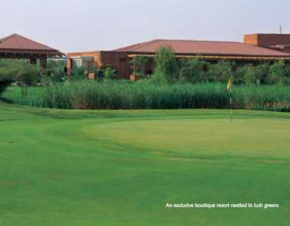
An exclusive boutique resort nestled in lush greens