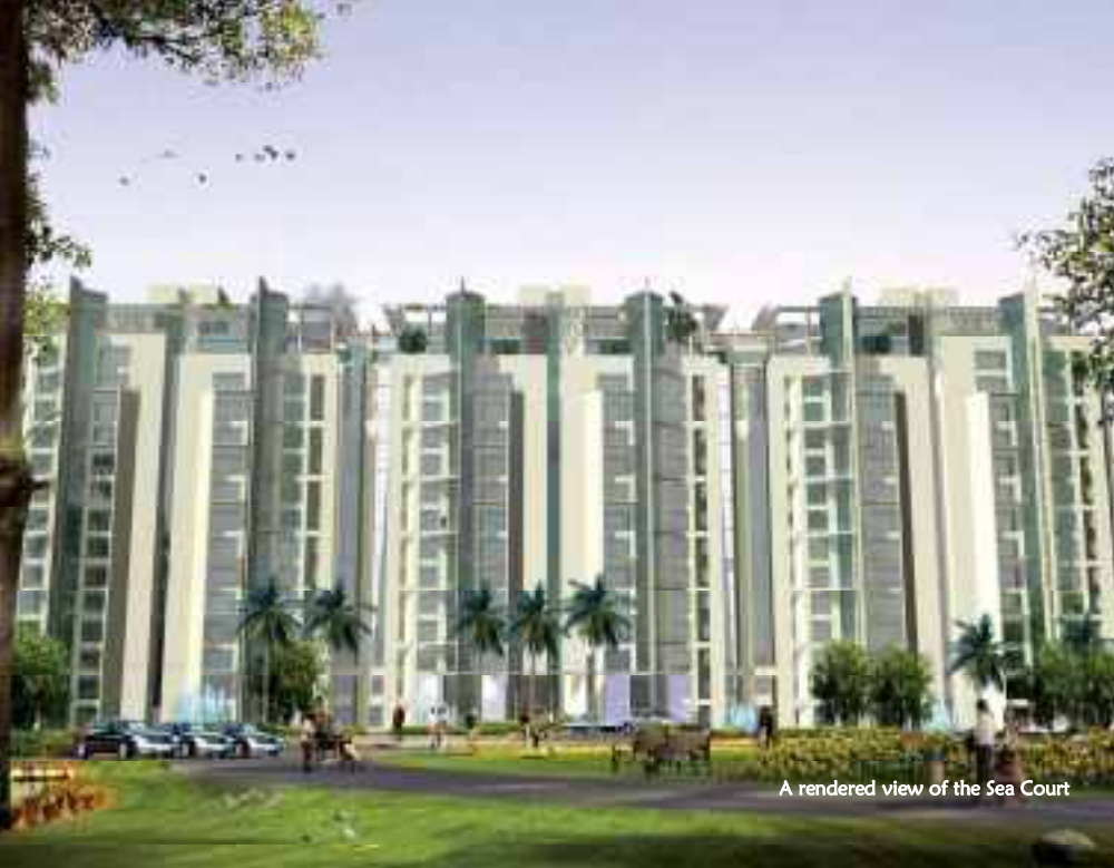
A rendered view of the Sea Court

...the reflection of your decision to choose excellence