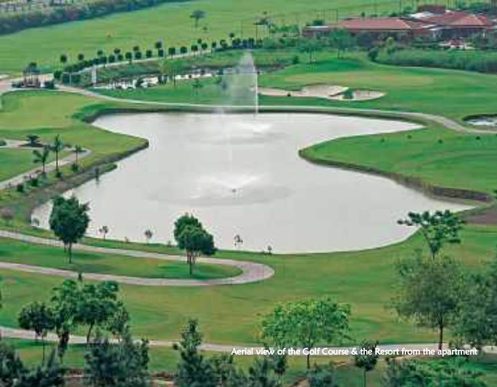
Aerial view of the Golf Course & the Resort from the apartment