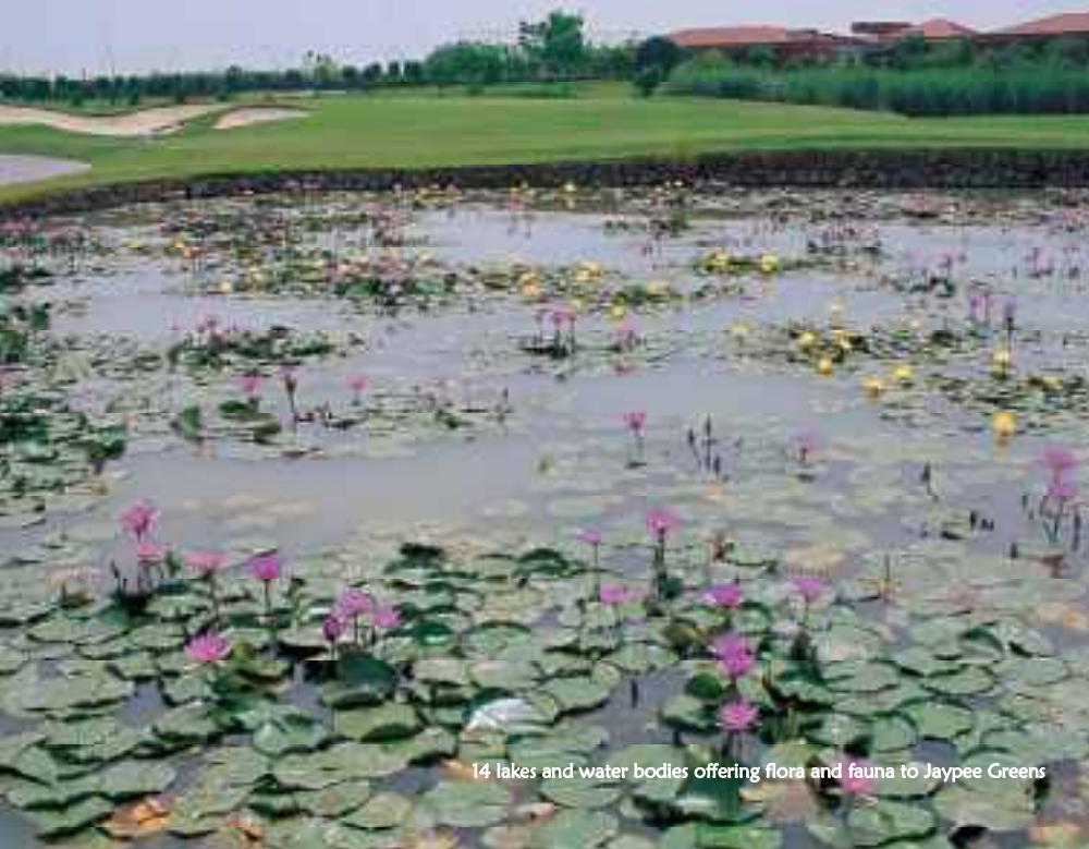
14 lakes and water bodies offering flora and fauna to Jaypee Greens

...a canvas blending light, shadow and contours