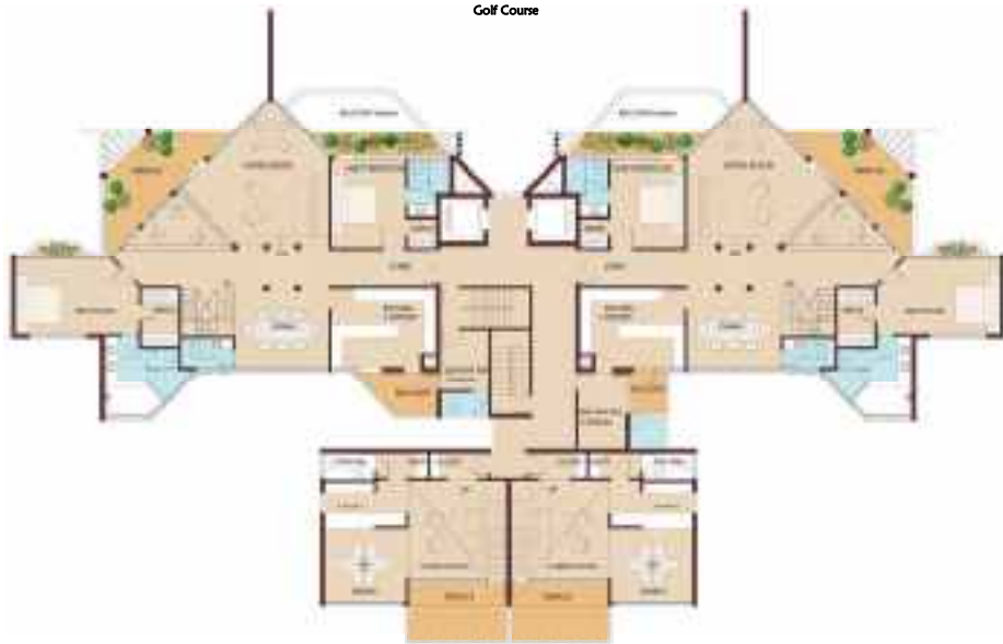
Typical Duplex Penhouse Level I Floor Plan