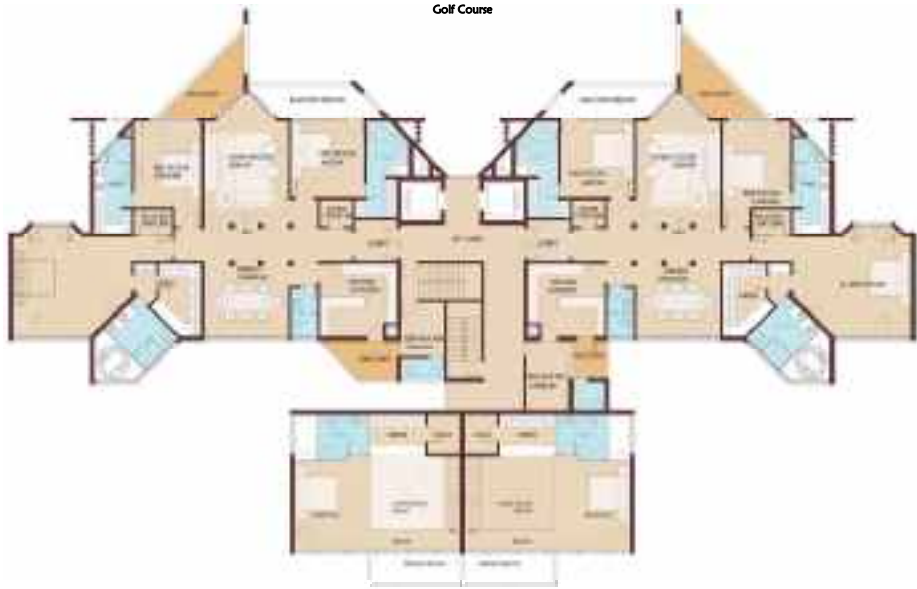
Typical Floor Plan with Loft Level II